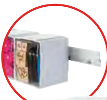
Tilt Bins Hang On Wall Mounting Bar 22773CR